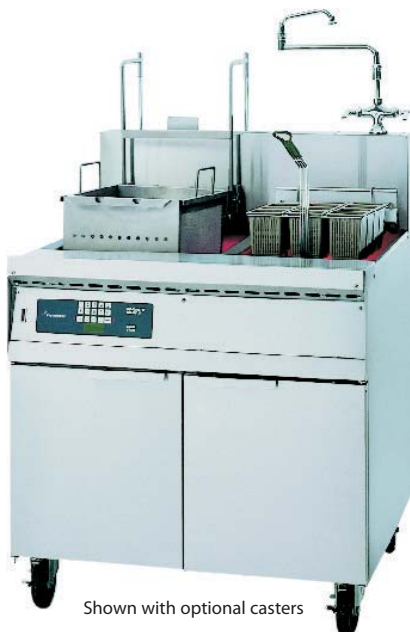
Shown with optional casters