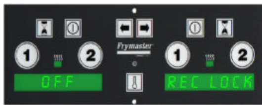
Computer in REC LOCK