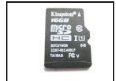
OLD CARD , 8122549 or 8263608 (above) is a Kingston. Cease using these SD cards.