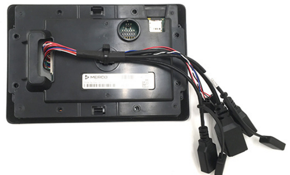
Rear View Ultratronik Controller