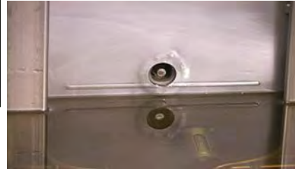
Oil is shown rising toward top-off probe.