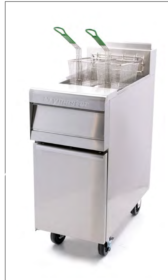
MJ 35/45/CF Series