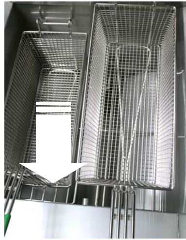
Figure 1: Repeatedly ramming a fry basket against the foam deck of a fryer to drain product causes damage, which is not covered by warranty.

Frypots submitted for warranty replacement exhibiting signs of abuse will be rejected.