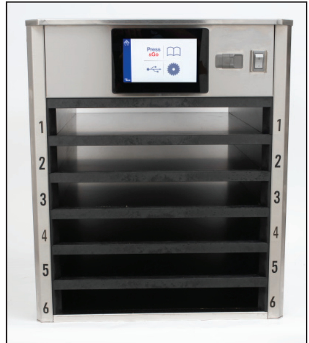
New UHCHD-T cabinet with touchscreen controllers. Tech training is available online.

• A service parts list will be provided as the population of the cabinet grows.