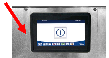
Newer FQ4000 Touch Screen Controller (Metal Bezel Surround)