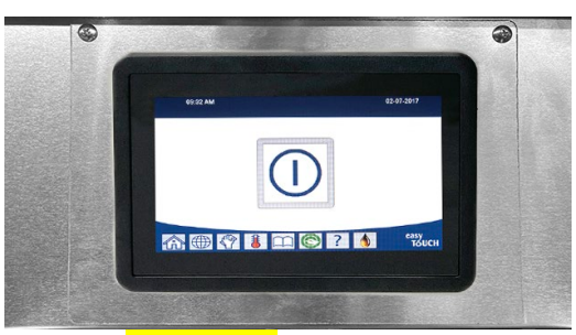
Figure 1 NEW STYLE 4000 Touch Screen Controller with Silver Stainless Metal Surround

When loading this software, check the versions of all the software on the controllers prior to updating software. If ALL the software match, update the software nonemally. If the software on AMY of the controller software the software on another controller, ensure the controller that matches the software version BELOW IS NOT_LOCATED in the far-left position. Swap the controllers if necessary. <u>Disconnect</u> the controller(s) that have the software version that MAICHES the version below. Once software is updated, reconnect the controller(s).