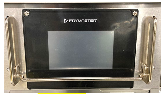
Figure 2 OLDER STYLE 4000 Touch Screen Controller with Black Plastic Surround

If the fryer has ALL of the NEWER STYLE 4000 controllers, with the SILVER STAINLESS METAL SURROUND (see Figure 1), they will use the software package located at the middle of each software package page (see below) shown with the SILVER STAINLESS METAL SURROUND controller.